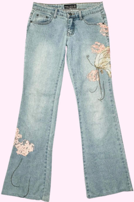
Low rise flared jeans