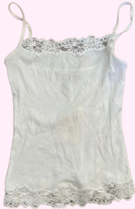
Lace trim camisole