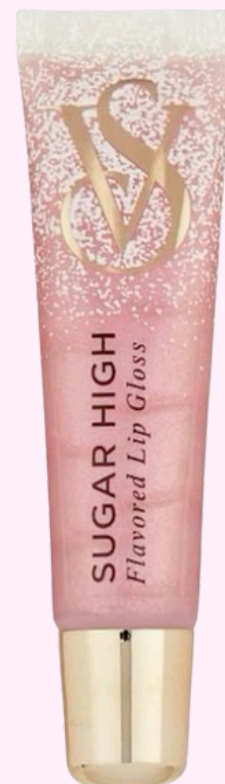
Victoria's Secret Lip gloss