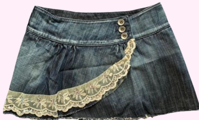
Denim mini skirt