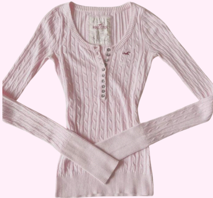
Long sleeve ruffled blouse