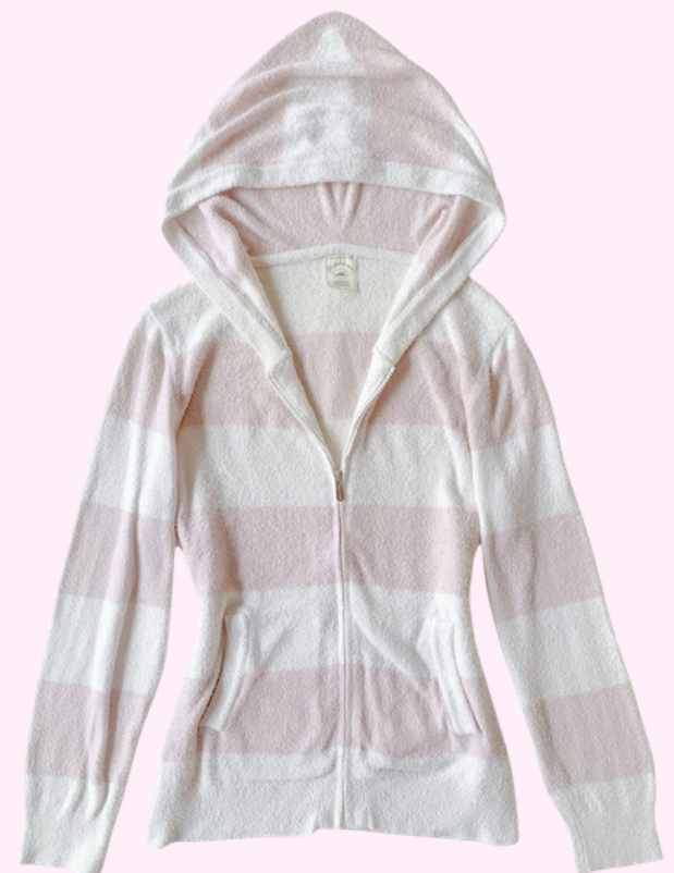
Striped button-up blouse