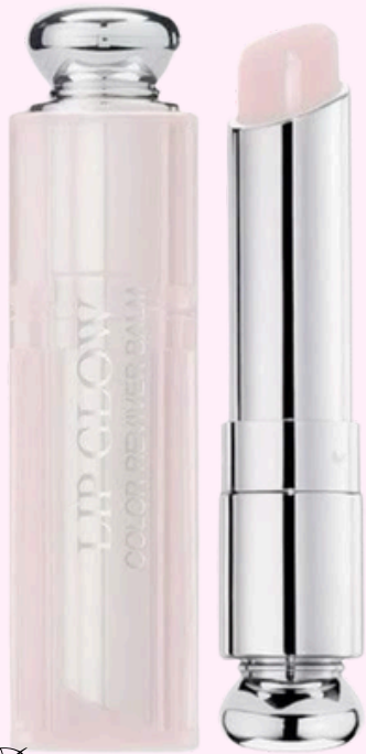
Dior addict lip balm