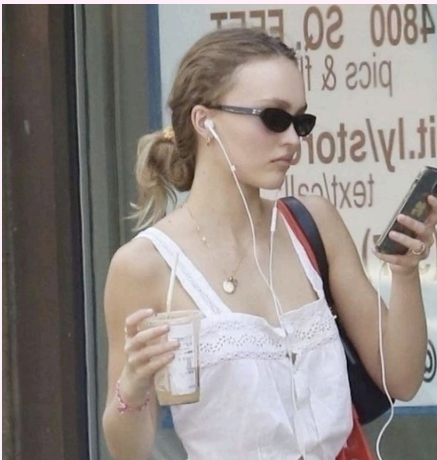
Lily Rose Depp